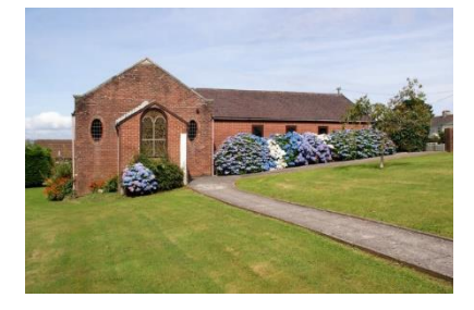
in manus tuas domine