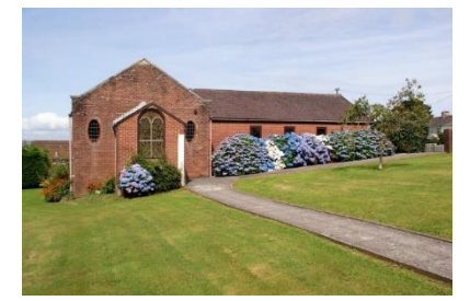
in manus tuas domine