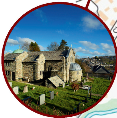
ST CUTHBERT MAYNE CHURCH