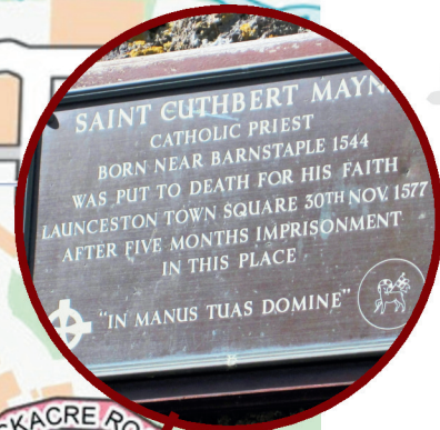
LAUNCESTON CASTLE DUNGEON