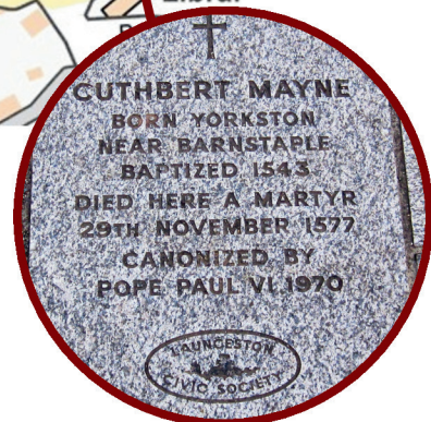
LAUNCESTON TOWN SQUARE